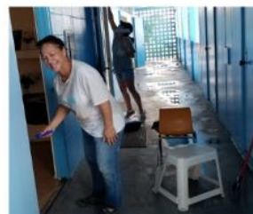
Staff and OLGC School Families participate in Sweep, Scrape, Shine events