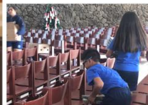
Students can help to prepare or clean the church